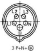
CEE 13520 5 Pin 3P + N 400V 32A

Dedicated circuit required for each installation.