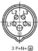
CEE 13520 5 Pin 3P + N 400V 32A

* Adequate cabinet ventilation should be provided for all drop-in models to prevent overheating of unit.