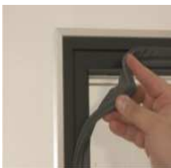
Magnetic removable gasket without tools