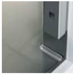
Internal bottom made in S/S with stamped rounded corners to facilitate the cleaning procedures.