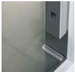
Internal bottom made in S/S with stamped rounded corners to facilitate the cleaning procedures.