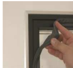
Magnetic removable gasket without tools